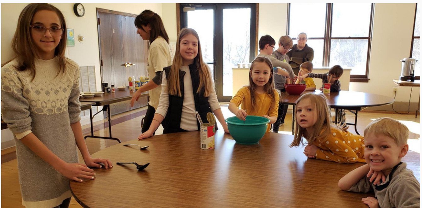
Preparing Mac and Cheese on February 12.