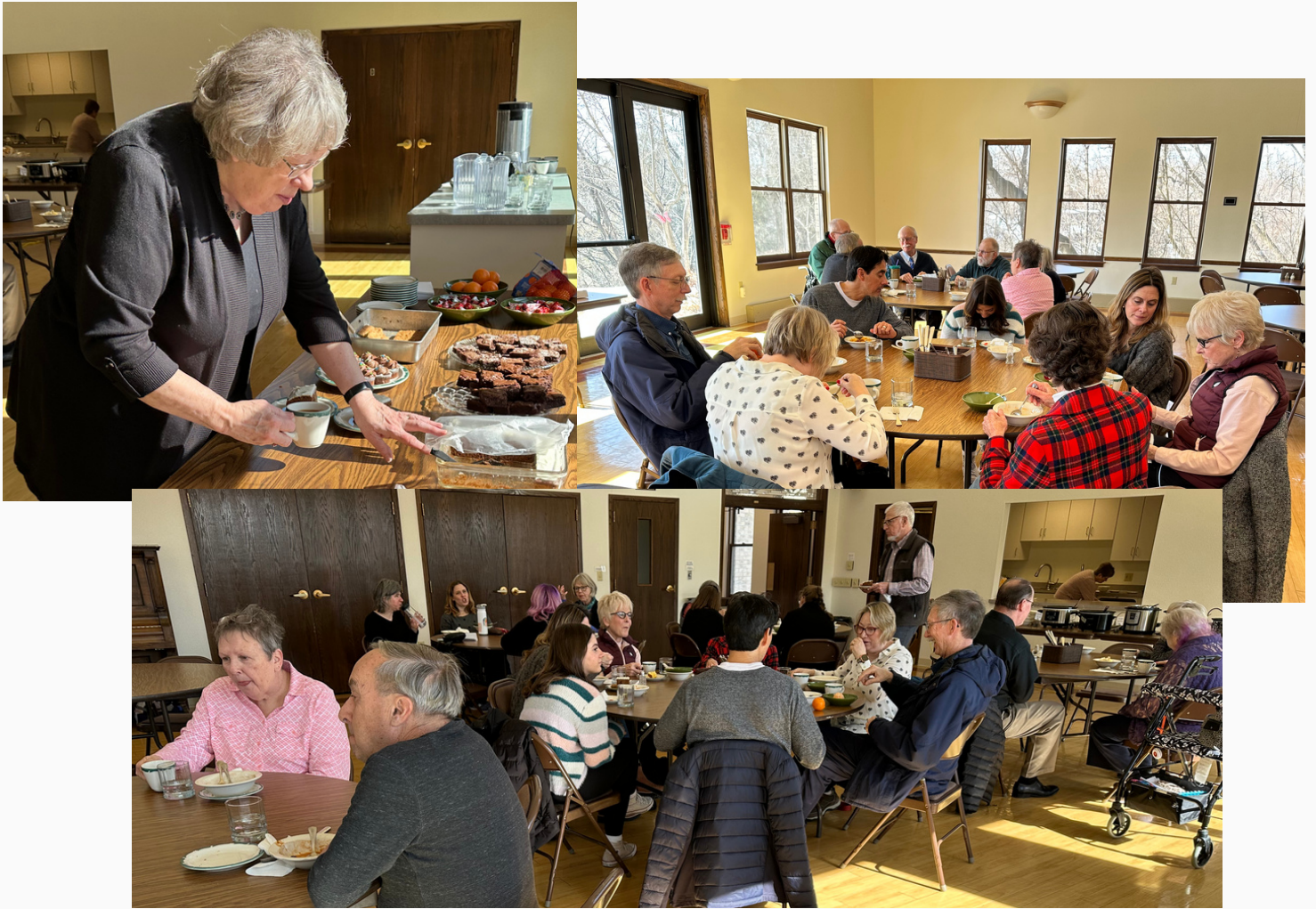
Soup and Salad Potluck Lunch on February 19.